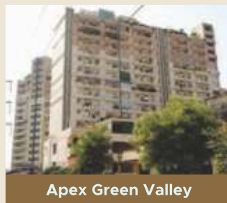
Apex Green Valley