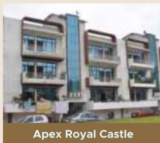
Apex Royal Castle