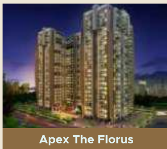
Apex The Florus