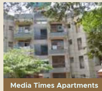
Media Times Apartments