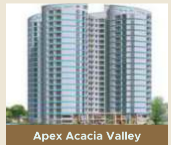
Apex Acacia Valley